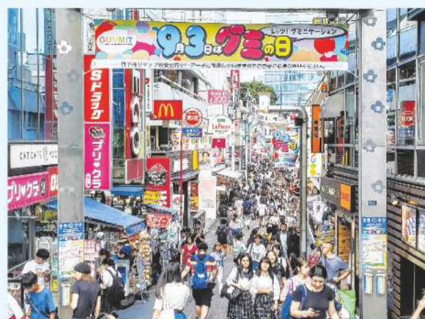
Takeshita Street, Tokyo.