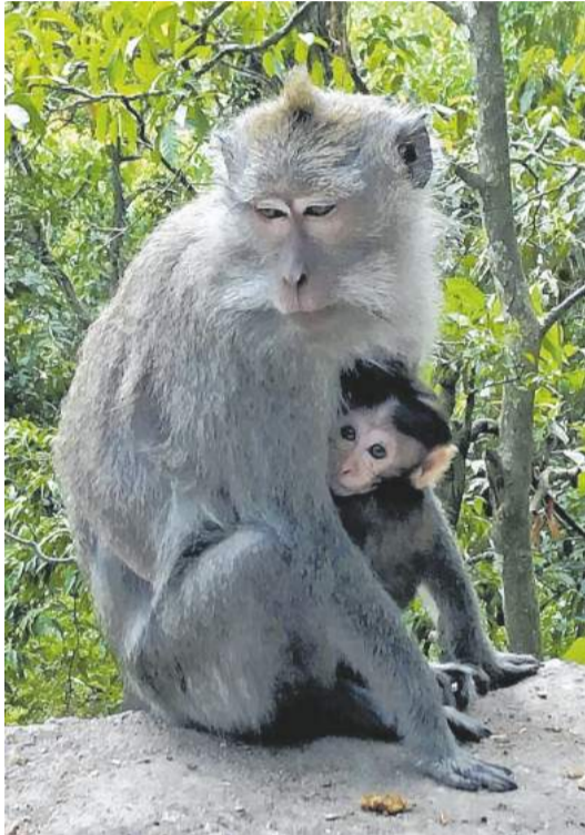
Monkeys in Lombok.

That means you must go with the flow if your driver runs a little late and try not to plan