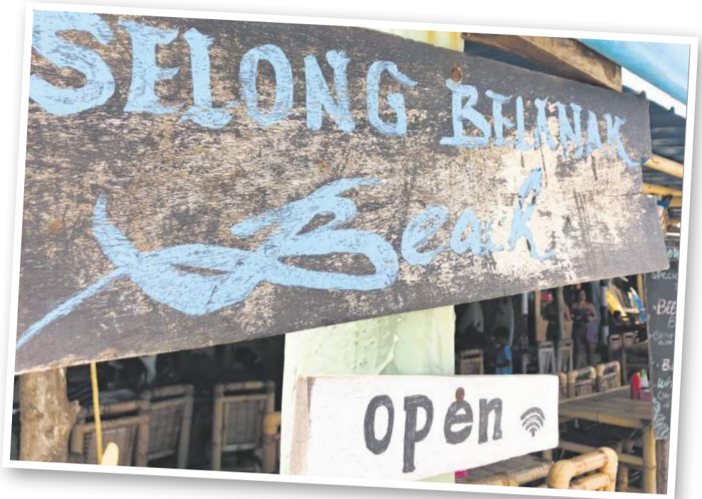
Selong Belanak Beach.