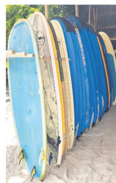
Surfboards at Selong Belanak Beach.

stop the parents zincing up and giving it a crack too.