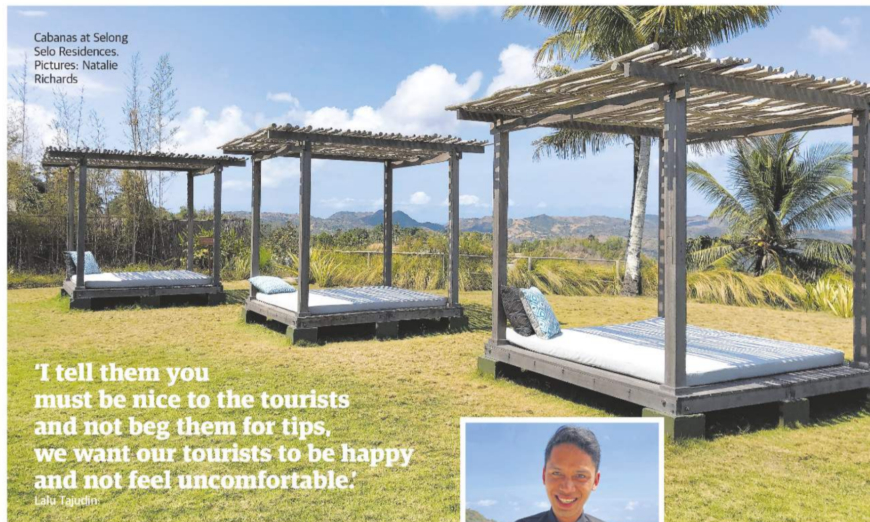
Cabanas at Selong Selo Residences.

"I tell them you must be nice to the tourists and not beg them for tips, we want our tourists to be happy and not feel uncomfortable."